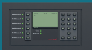
Fire alarm system (FAS)

Fire blanket is stored in a protected location inside the wall cassette unit